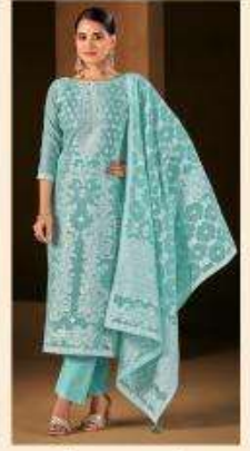
❖ 107-003 ❖