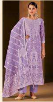
❖ 107-005 ❖