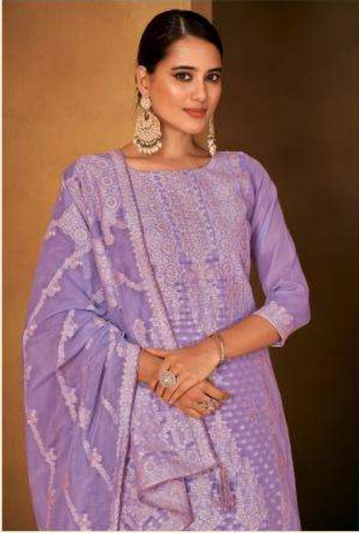
Banarasi Adha Vol-3