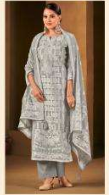
❖ 107-006 ❖