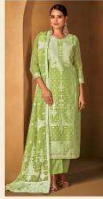
❖ 107-002 ❖