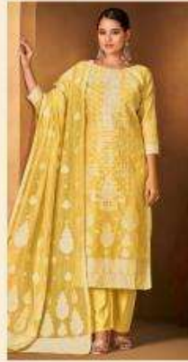
❖ 107-004 ❖