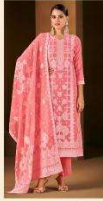
❖ 107-001 ❖