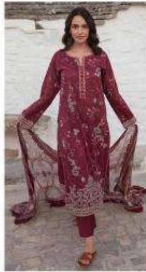
M - 105