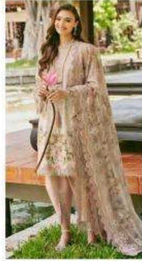
M - 103