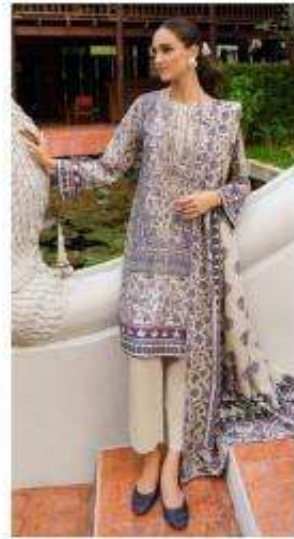
M - 106