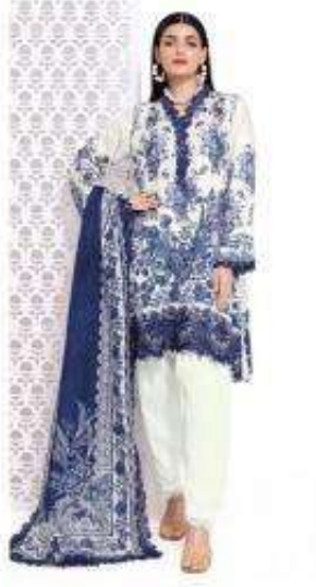
M - 102