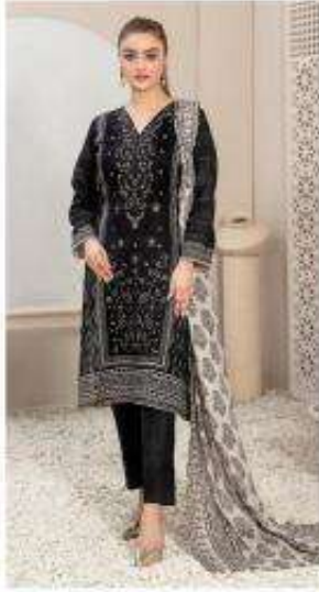
M - 101