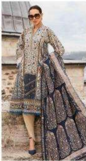
M - 104