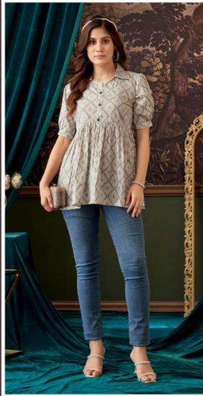
D No. 1002