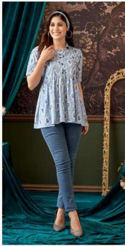
D No. 1001