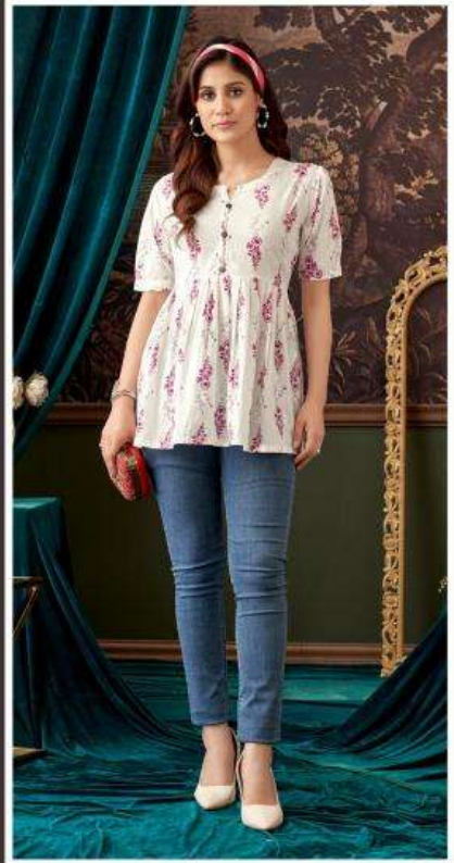
D No. 1003