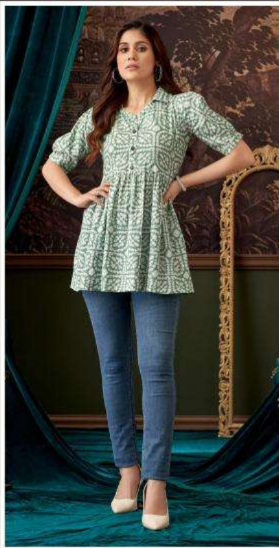
D No. 1004