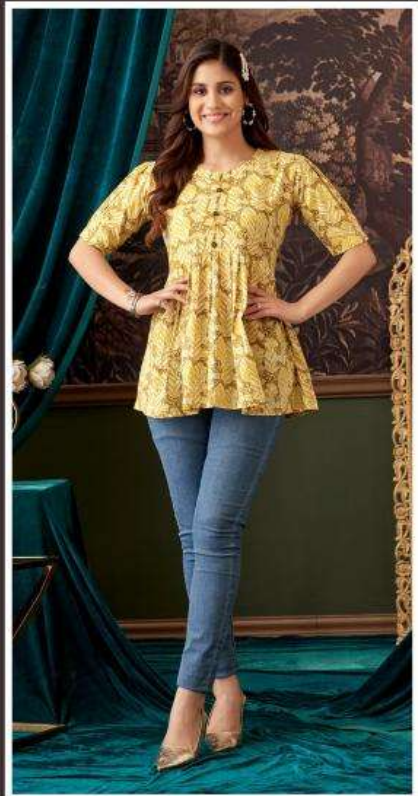
D No. 1005