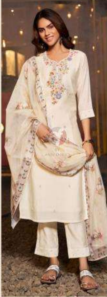
Chandani VOL.3 D.no.3734