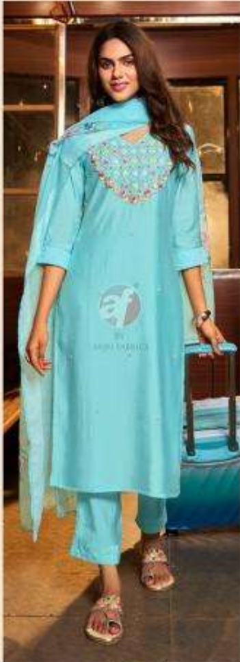
Chandani VOL.3 D.no.3731