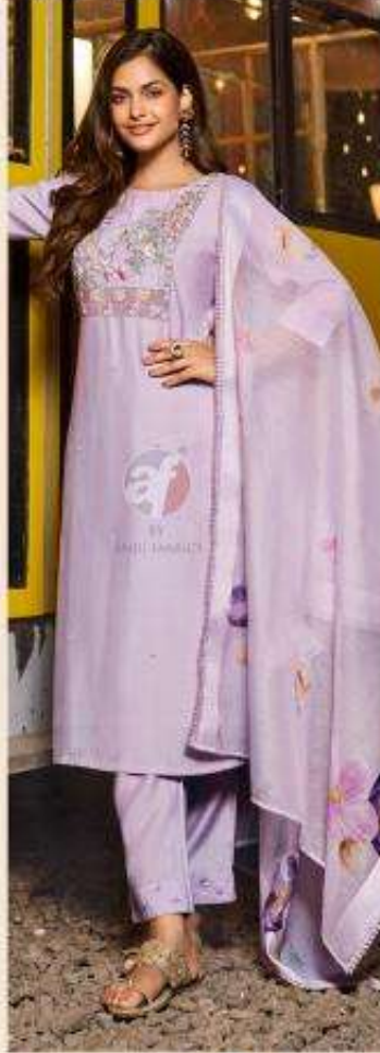
Chandani VOL.3 D.no.3735