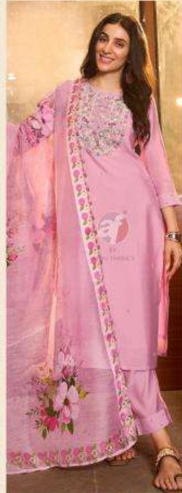
Chandani VOL.3 D.no.3733