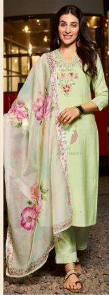
Chandani VOL.3 D.no.3736