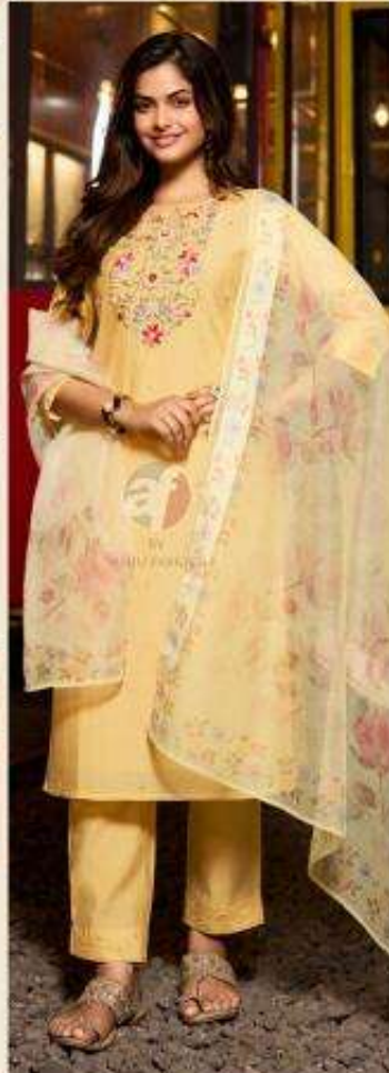
Chandani VOL.3 D.no.3732