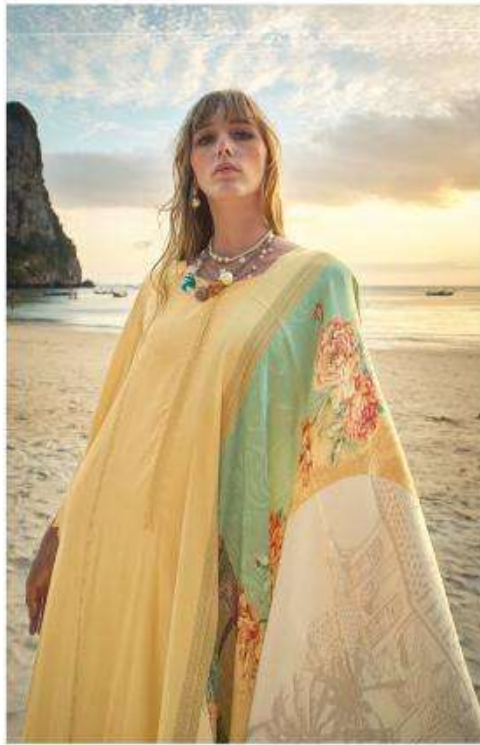
Spurred the public attention of Tashkent, she became the city's new design icon. WALK ATTIRE IN THE COLOURS OF ashu on the sky of cotton and cashmere. ashu - long and soft like a song, it's inspired from the landscape for a special ashu 's daily culture.