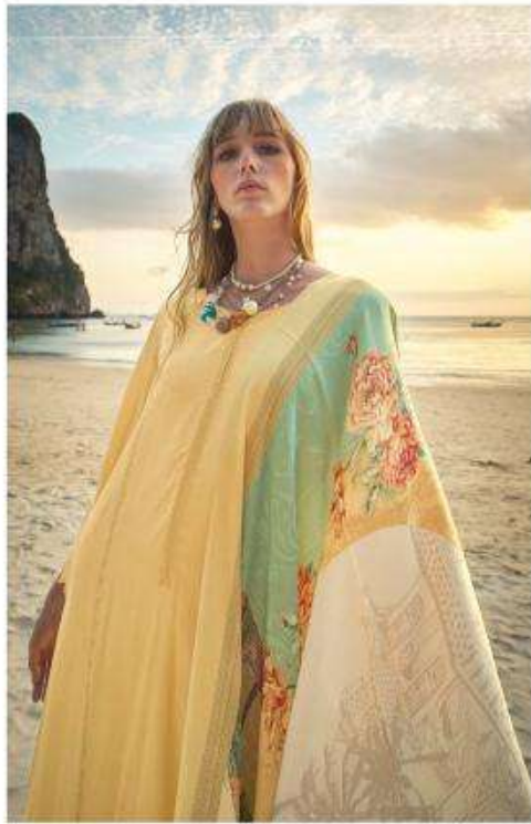
Spurred the public attention of Tashkent, she started the air was change course to BASK ATTIRE IN THE COLOURS OF SUN on the of yellow and white. Being strong she she takes a step, it's inspired from her husband for a golden, she's a lady, calm.