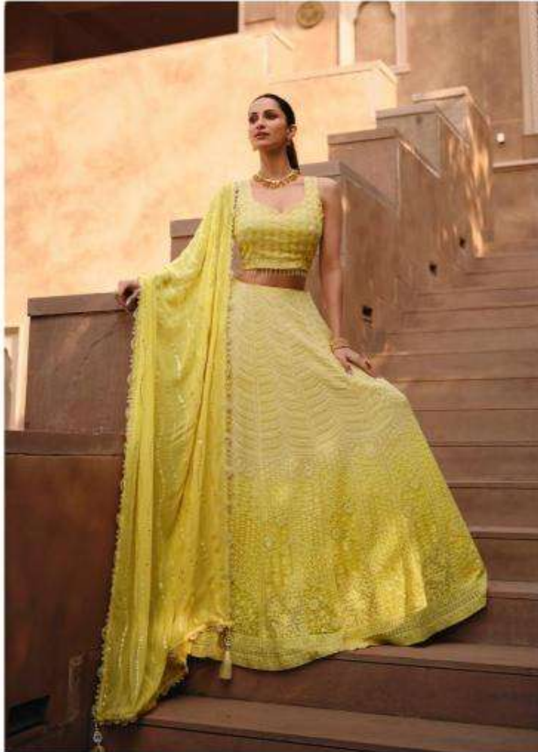
The blend of thoughtful detailing and deep hues have a wonderful clothing treat this season!