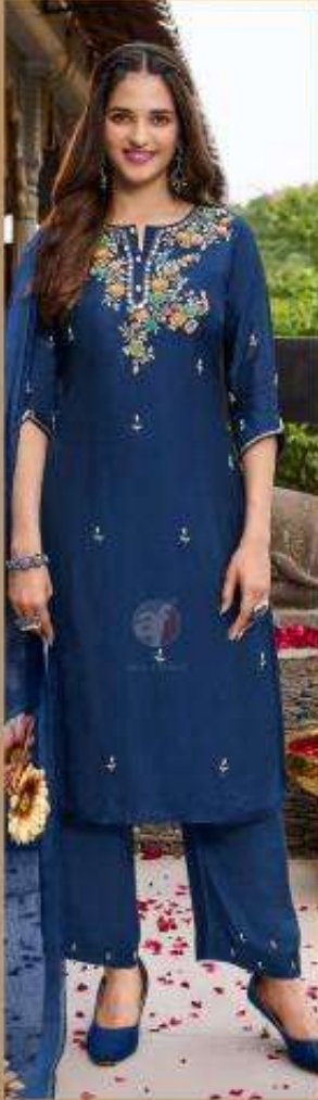
Ghughhat VOL-11 •3861•