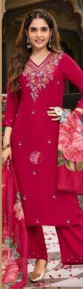
Ghughhat VOL-11 •3862•