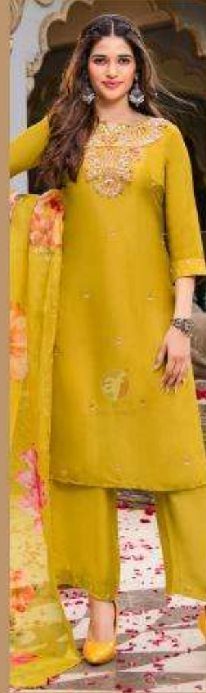
Ghughhat VOL-11 •3863•