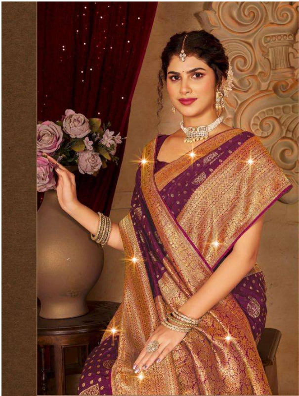
One of the elite designer wears in rare bright color combination.