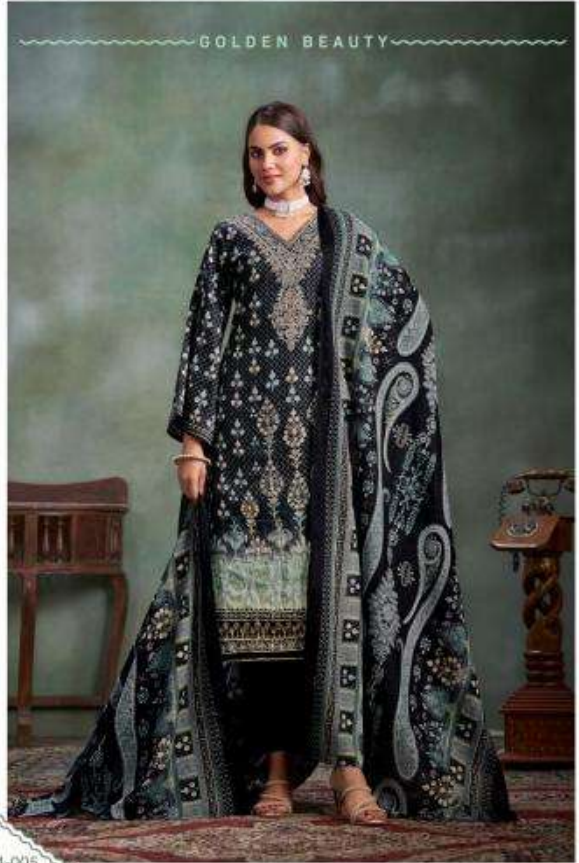
604-005 "What you wear is how you present yourself to the world, especially when what you wear is a part of your identity."